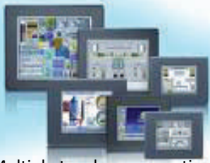
Multiple touch screen options